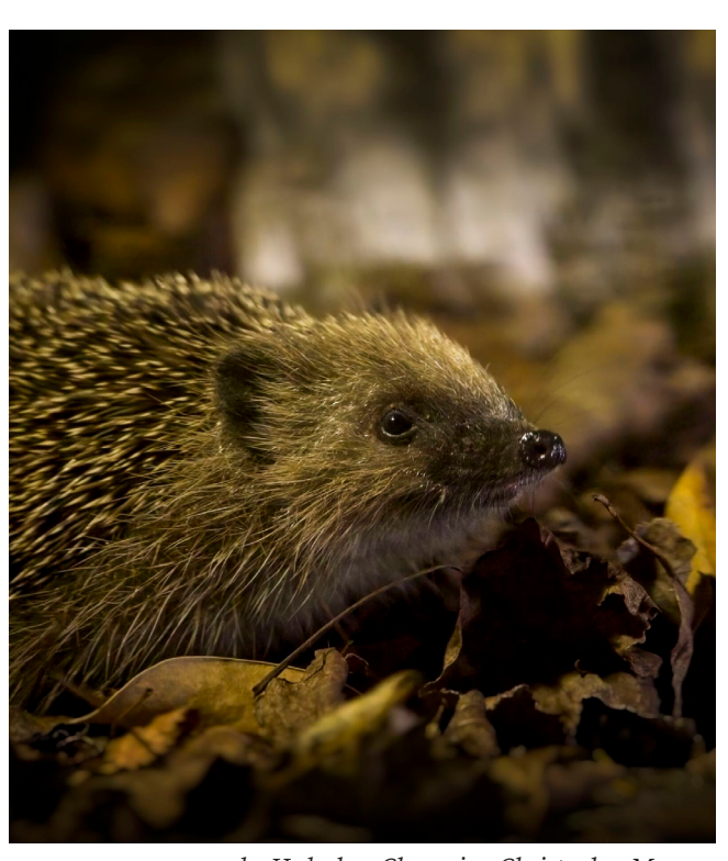
by Hedgehog Champion Christopher Morgan

Data and anecdotal evidence from vets and rehabilitation facilities suggest that injuries and deaths from encounters with garden machinery, ponds, and bonfires have an impact on Britain's hedgehog population. Site clearances for development and building works are also thought to be a problem for the species. This threat is considered to require a two-pronged approach that targets the industry level (i.e. developers and manufacturers of garden machinery) and the public who are catered to by developers and who use garden machinery.