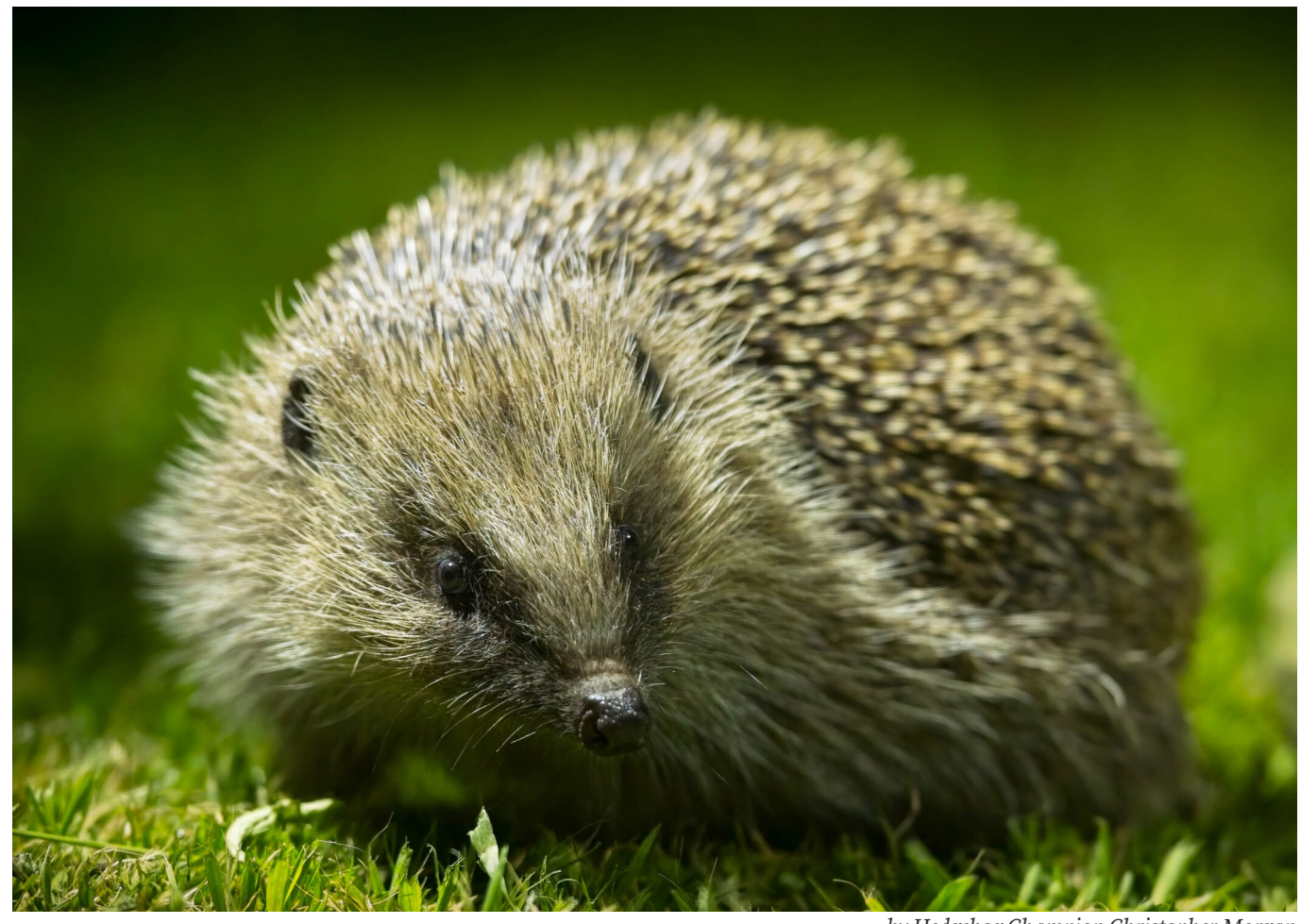
by Hedgehog Champion Christopher Morgan

The State of Britain's Hedgehogs reports, published every three to four years by PTES and BHPS (Wembridge et al., 2022), uses wildlife survey data to paint a vivid picture of how hedgehog populations are changing. Early reports in 2011 and 2015 showed a historical decline across the species' range in Britain, with widespread losses occurring over several decades. More recently, survey data have revealed differences across rural and urban landscapes, with a slower decline in the latter. Suburban gardens and greenspaces increasingly appear to be a stronghold for the species compared with