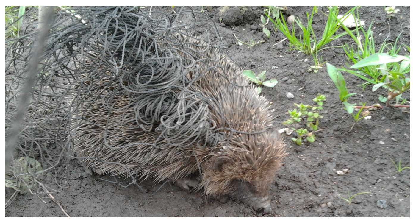
by Hedgehog Champion Penny Oakley

Roads are likely the biggest single cause of adult hedgehog mortality in Great Britain. Recent research into the impact of roadkill (Moore, 2023) shows that the impact on population growth rates depends on the size of the population, with large populations able to compensate for road mortality, whereas smaller ones can be seriously affected, further accelerating their decline. As a result of this research, roads were deemed a lesser priority than other causes of mortality by the strategic