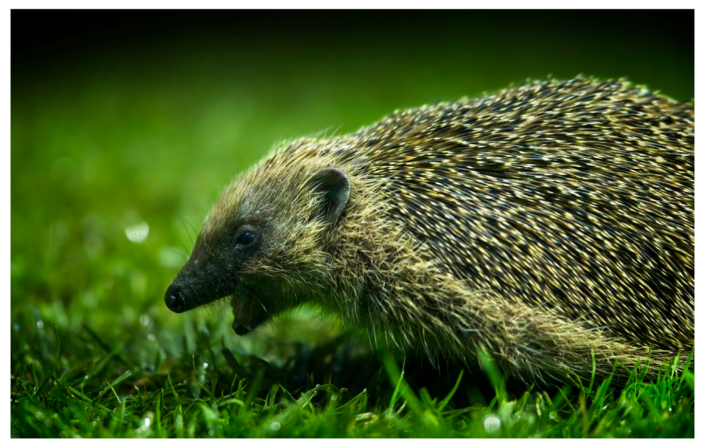
by Hedgehog Champion Christopher Morgan

Although it is difficult to fully predict the impacts of climate change on hedgehogs, more extreme and erratic weather patterns, for example increasing periods of drought, are rapidly becoming more common. These patterns could well lead to further macroinvertebrate food reduction, and possible changes in the hedgehog host-parasite relationship as a result of increased temperatures. Increasingly wet winters, resulting in frequent flooding, might compound the risk of drowning during the winter hibernation period. The trend towards milder winters may also result in more frequent arousal from hibernation resulting in depletion of fat reserves, leading to poorer body condition and a potential impact on reproduction and survival.